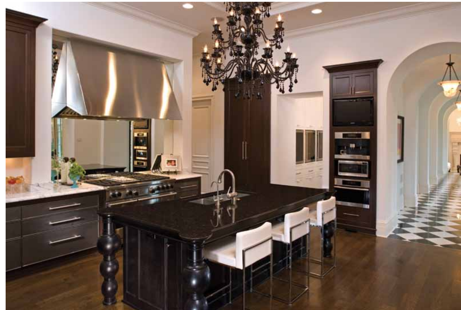
BELOW: Filled with gorgeous contrasts, the home’s modern kitchen sits off an old-world gallery to the right in dramatic black and white.